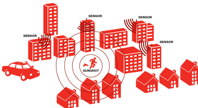
Figure 1: ShotSpotter “Coverage Area”

In addition, they can append the alert with any other critical intelligence such as whether a full automatic weapon was fired. This process takes less than 60 seconds between the actual shooting and the digital alert (with a precise location dot on a map) popping onto the screen of a computer in the 9-1-1 Communications Center.